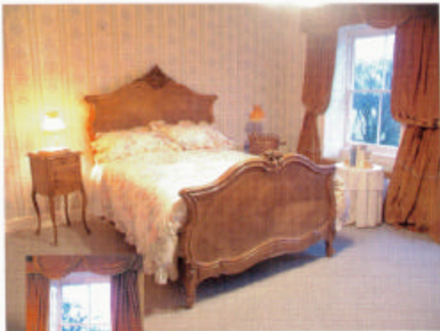
Large double rooms, en-suite, furnished with antiques.