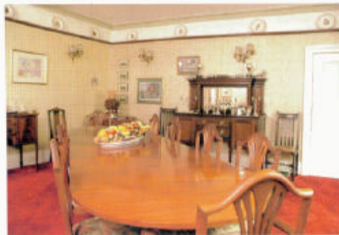
Breakfast is served in the family dining room.