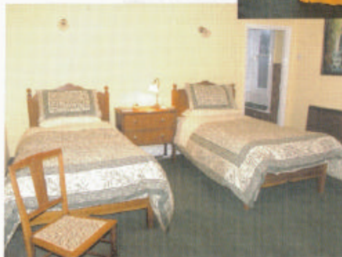
The twin bedroom with en-suite facilities.