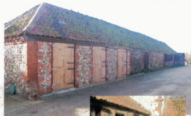
Stabling for up to 11 visiting horses and DJY livery yard